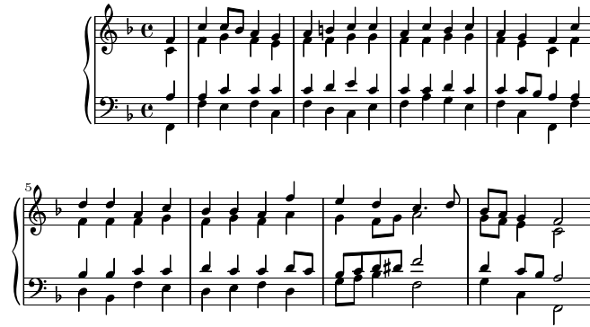
Figure 3: Most likely harmonisation under our model of chorale K389, BWV 438

sequences given their respective melodic symbol sequences, -\frac{1}{T} \ln P(C|Y) , on training and test data sets of chorales in major and minor keys. As a comparison we give analogous negative log probabilities for a model predicting chord states from their respective melody notes, -\frac{1}{T} \sum \ln P(c_t|y_t) , for a simple Markov chain between the chord states, -\frac{1}{T} \sum \ln P(c_t|c_{t-1}) , and for a model which assumes that the chord states are independently drawn, -\frac{1}{T} \sum \ln P(c_t) . The Hidden Markov Model here has 5046 hidden chord states and 58 visible melody states.